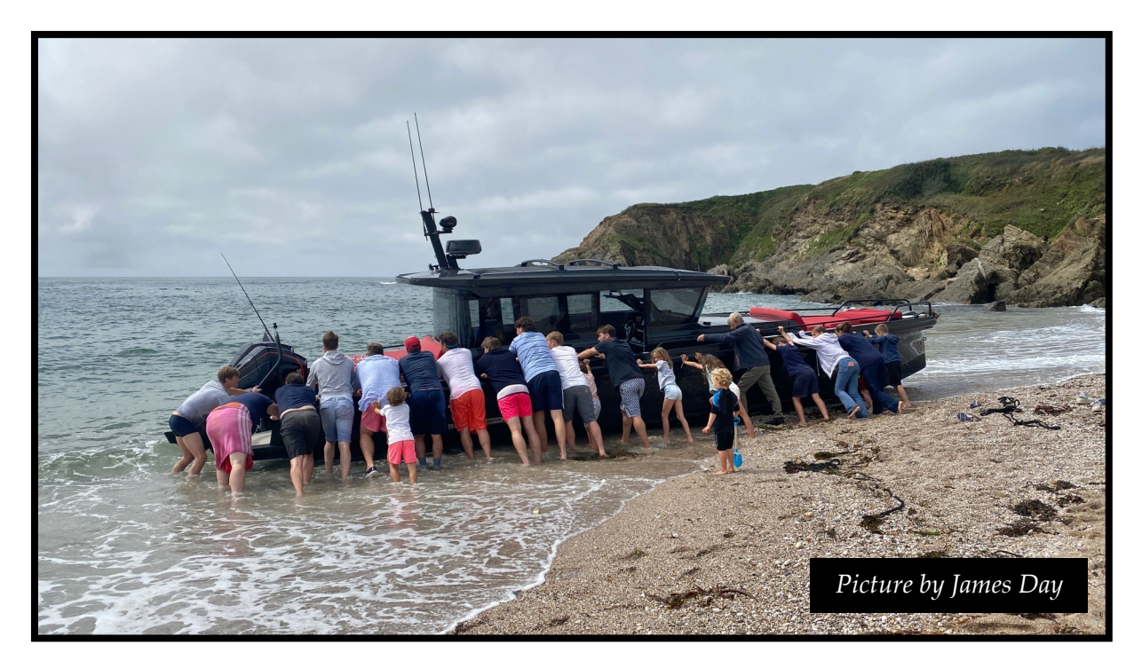
Well, that's one way to refloat your boat! Having been left high and dry on Leas Foot Beach when the tide went out, the owner of this Guernsey-registered vessel mustered a willing crew to give him a push back into Bigbury Bay